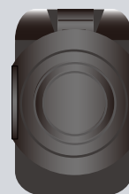
Flat Swivel Mount

*Specifications are subject to change without prior notice.